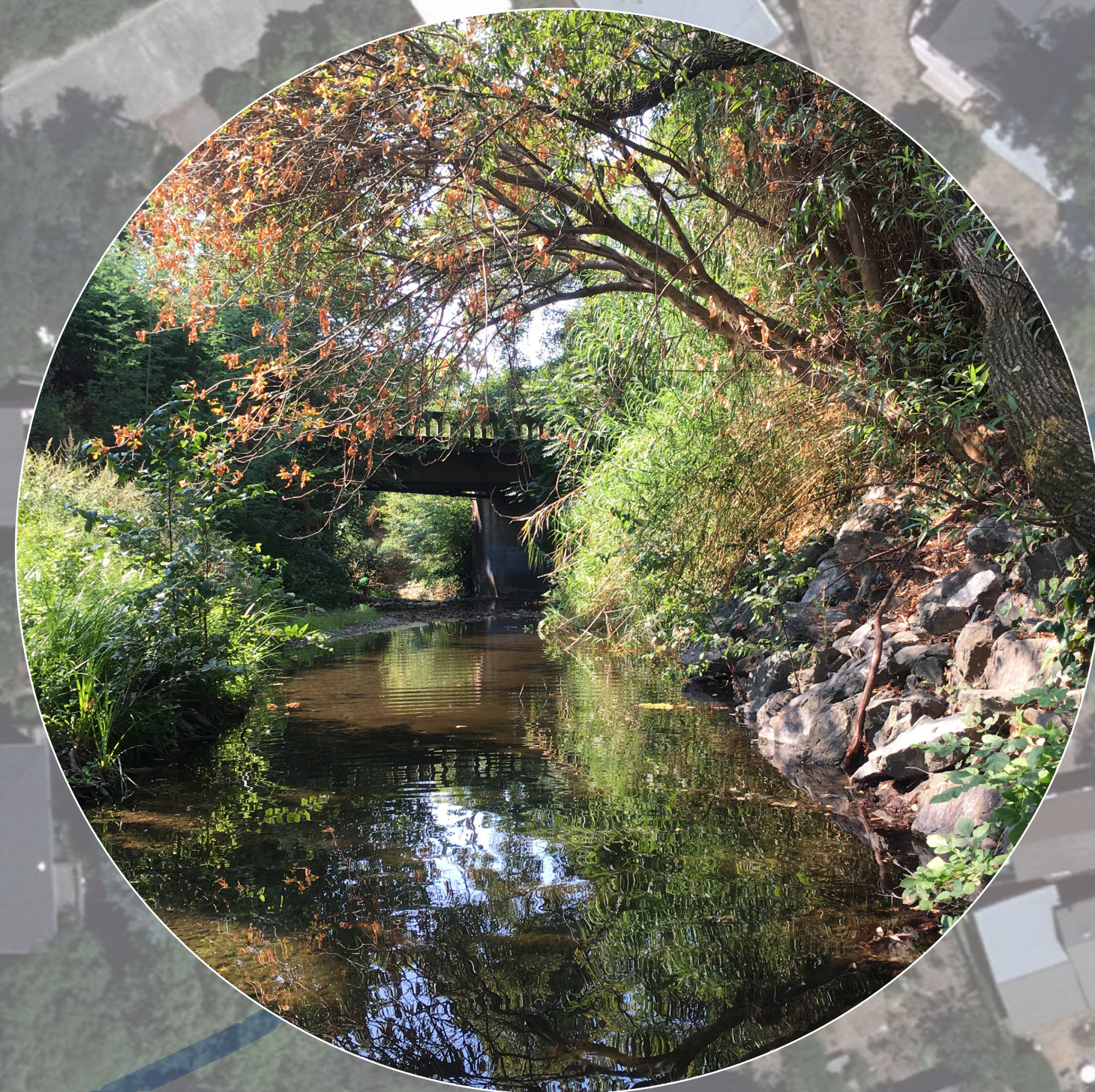
View of Bridge from North